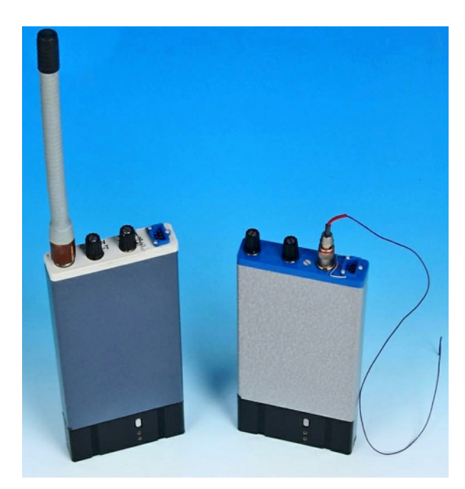
PR-36 Oberon (left) in comparison with its predecessor PR-35 Faun. (right)

In the GDR there were intentions to replace the PR-35 Faun by the PR-36 in 1989. This might have been a 160MHz version Due to the collapse of the Soviet Union, and the fall of the Berlin Wall, it is not known whether the PR-36 eventually was issued.