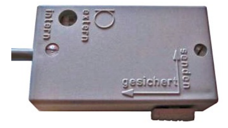
Different, probably later issued version of the PR-36 remote control unit.