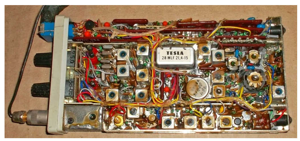
Internal view of PR-36 with its outer cover removed