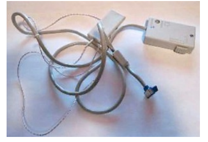
Remote control unit with a vibrator connected. Other variations of this unit have been noted.