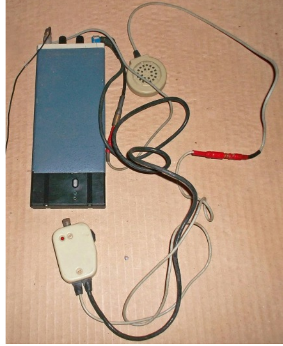
Basic remote control unit. This variation had neither a built-in loudspeaker nor a vibrator unit.